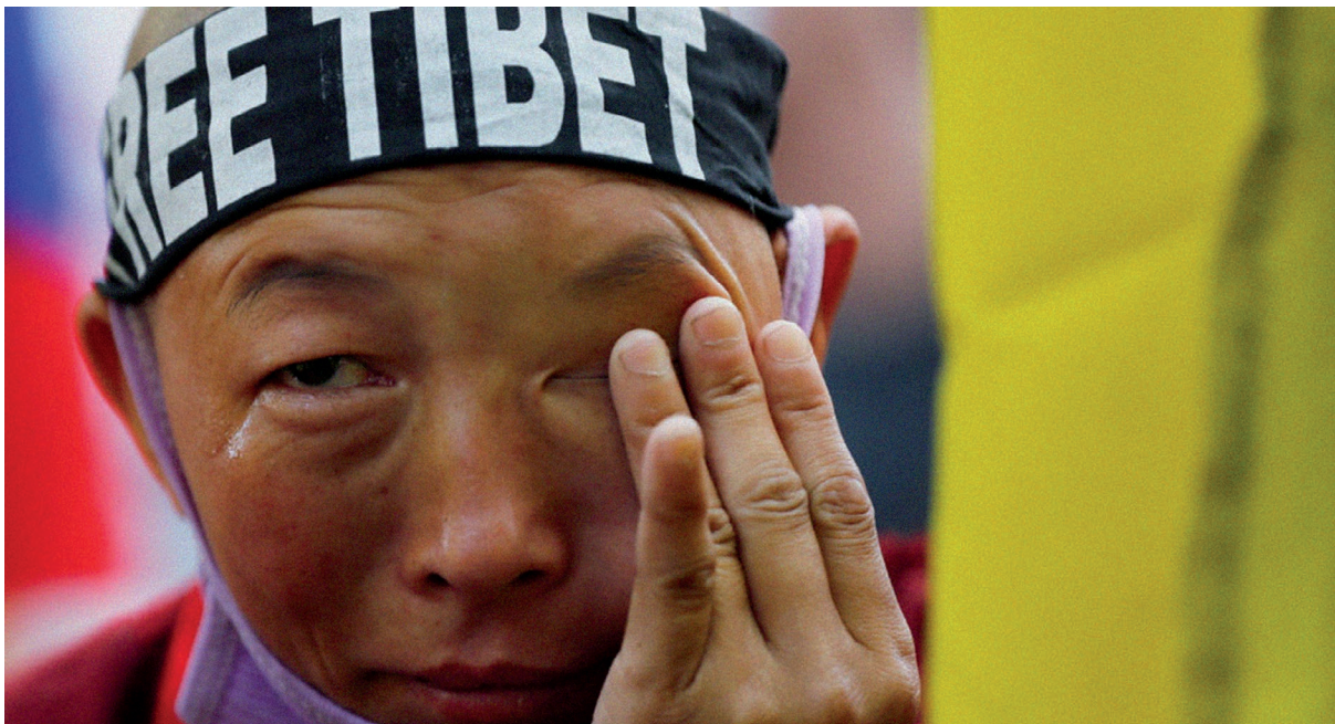
A Tibetan nun cries as she attends a protest held to mark the 60th anniversary of the Tibetan uprising against Chinese rule, in New Delhi, India, March 10, 2019.

At the General Assembly, China voted against resolutions that spoke out for victims of human rights in Iran, Syria, and Crimea and failed to support resolutions on behalf of human rights victims in Georgia and Ukraine. China also supported counterproductive resolutions that undermined individual human rights by elevating vague and undefined rights such as the “right to peace” above universally recognized individual human rights, shielded human rights abusers through a resolution denying the right to sanction such regimes, and opposed a resolution on the responsibility to prevent genocide.