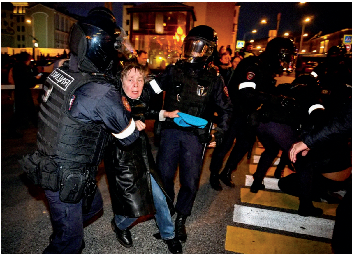
Police officers detain protesters at the mobilization protest in Moscow