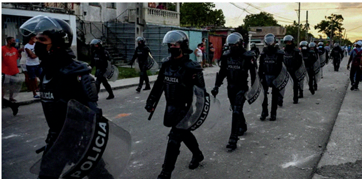
Riot police walk the streets after a demonstration against the government in Arroyo Naranjo municipality, Havana, last July.

sentenced. 37 According to U.S. government data, since October 2021, more than 140,000 Cubans have moved to the U.S. in search of a better life. 38