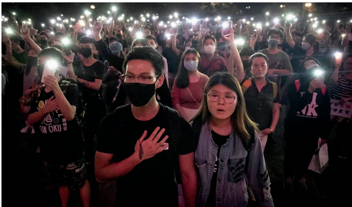
Demonstrators at a rally in Hong Kong in October 2019.

close. 18 In June, the biggest LGBT center in China—Beijing LGBT Center—closed after 15 years. 19