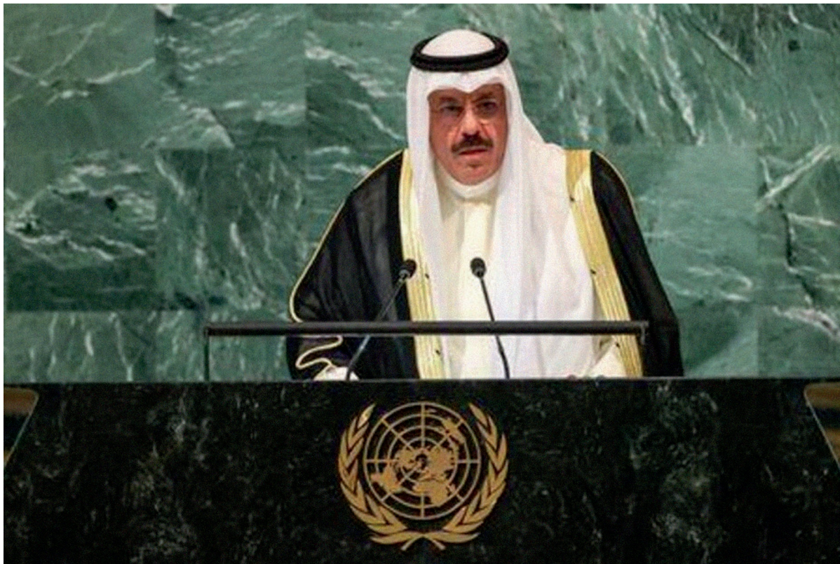
Sheikh Ahmad Nawaf Al-Ahmad Al-Sabah, Prime Minister of Kuwait, addresses the 77th Session of the United Nations General Assembly at U.N. Headquarters in New York City, U.S., September 22, 2022

this year some 500 people were fined for retweeting so-called illegal posts. 63