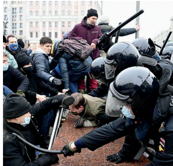
Protesters clash with riot police during a rally in support of jailed opposition leader Alexey Navalny in downtown Moscow, Jan. 23, 2021.

At the General Assembly, Russia opposed resolutions that spoke out for human rights victims in Iran and Syria. Russia also supported counterproductive resolutions that undermined individual human rights by elevating vague and undefined rights such as the “right to peace” above universally recognized individual human rights, shielded human rights abusers through a resolution denying the right to sanction such regimes, and opposed a resolution on the responsibility to prevent genocide.