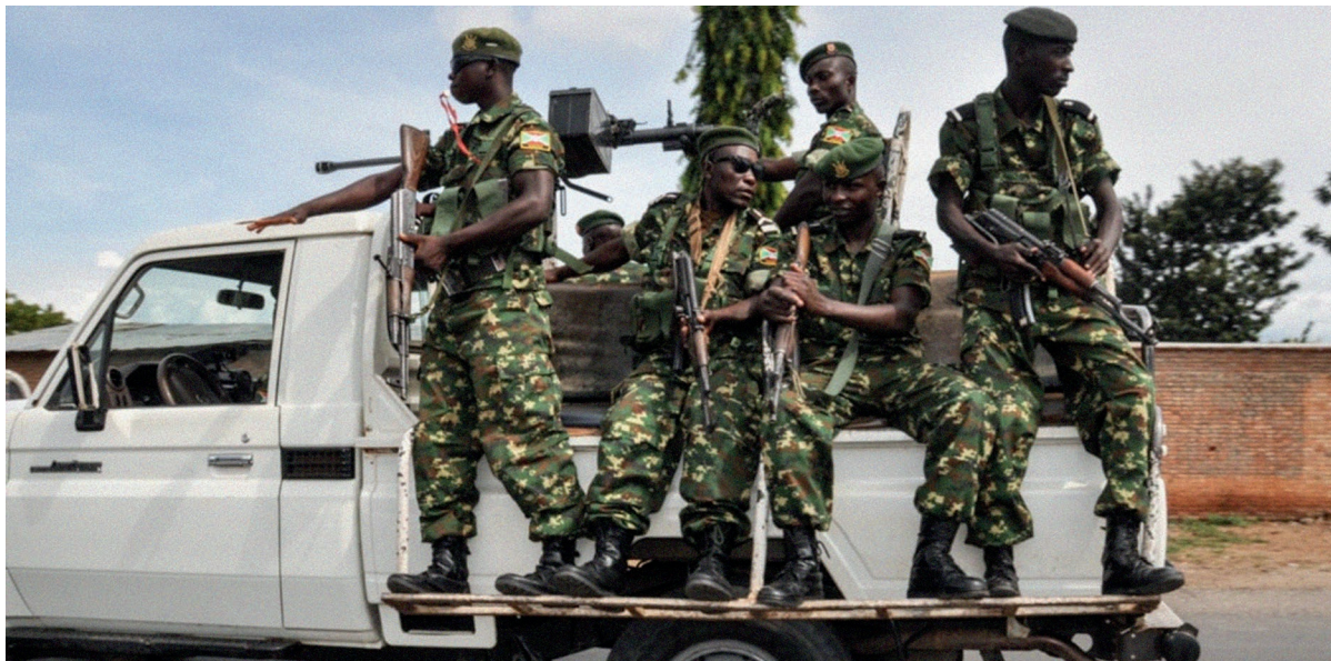
Burundi's security guards patrol in Bujumbra, Burundi, May 17, 2018. A spate of recent attacks on security forces and the ruling party's youth league has reportedly left dozens of people dead.

Burundian authorities had detained schoolgirls for defacing a picture of the president. 49